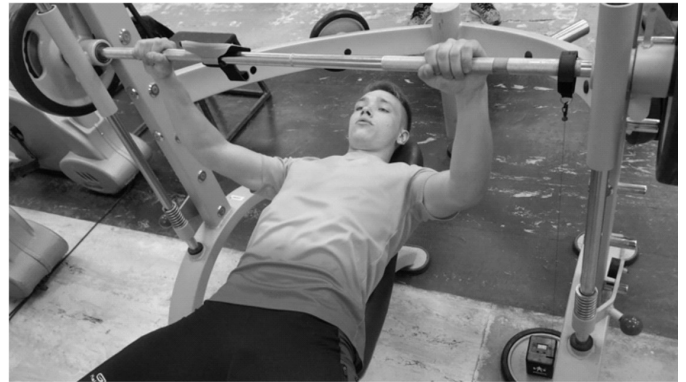
Figure 1. Position of the linear transducer and the TEL during the experiment.

measured with a validated linear transducer 19 (Speed4Lifts, Madrid, Spain), and smartphone (TEL), both attached to the bar. A running armband phone holder was used to attach the TEL (Figure 1) while the velcro strip supplied with the transducer was used to fix it in place. Statistical analysis was used to compare the mean concentric velocities for 70 lifts in order to verify the validity and reliability of the APP.