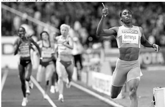
Figure 1. Arrival of the women's 800m final of the World Athletics Championships, Berlin 2009.

The perception that several of them are competing or have competed at the highest level in the 800 m trial, like the holder herself of the world record for that distance (1: 53.28 since 1983) seems very strange.